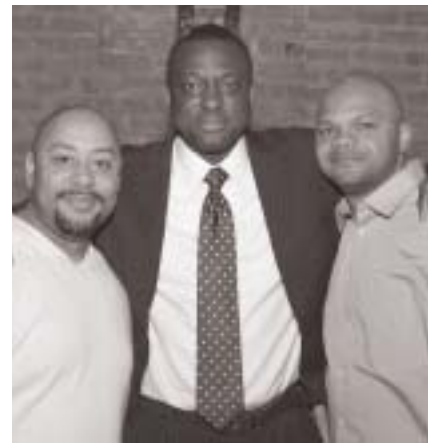
Central Park Five exonerees, from left, Raymond Santana, Yusef Salaam and Kevin Richardson.

In October, Governor Jerry Brown signed Senate Bill 618 into law, making it easier for wrongfully convicted people to receive state compensation. Under the previous law, exonerated individuals were entitled to $100 for every day they were wrongfully imprisoned, totaling $36,500 for every year served. The process for getting the money, however, was extremely difficult. Increasingly, exonerees were excluded from receiving payment because the state compensation board determined that their cases did not qualify as wrongful convictions or because the Attorney General was slow to respond to requests for compensation. The amended law will enable faster payment to exonerees, make the approval process more consistent and extend compensation to exonerees that were in county jail for a felony conviction.